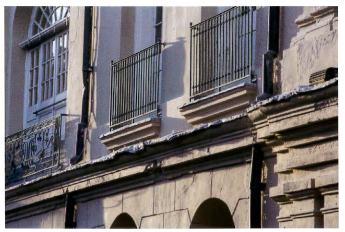
<u>E3A 1964 </u> - Exterior: section of balcony area along St. Ann Street