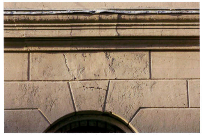
<u>E3A 1962 </u> - Exterior: detail of first-floor wall section along St. Ann Street