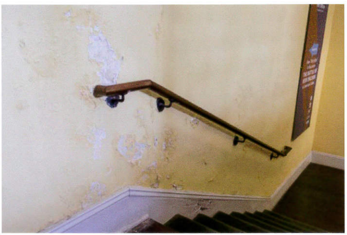
<u>E3A 2014 </u> - Interior: detail of wall along main staircase between second and third floors (leading to Battle of New Orleans and Antebellum Louisiana exhibits)