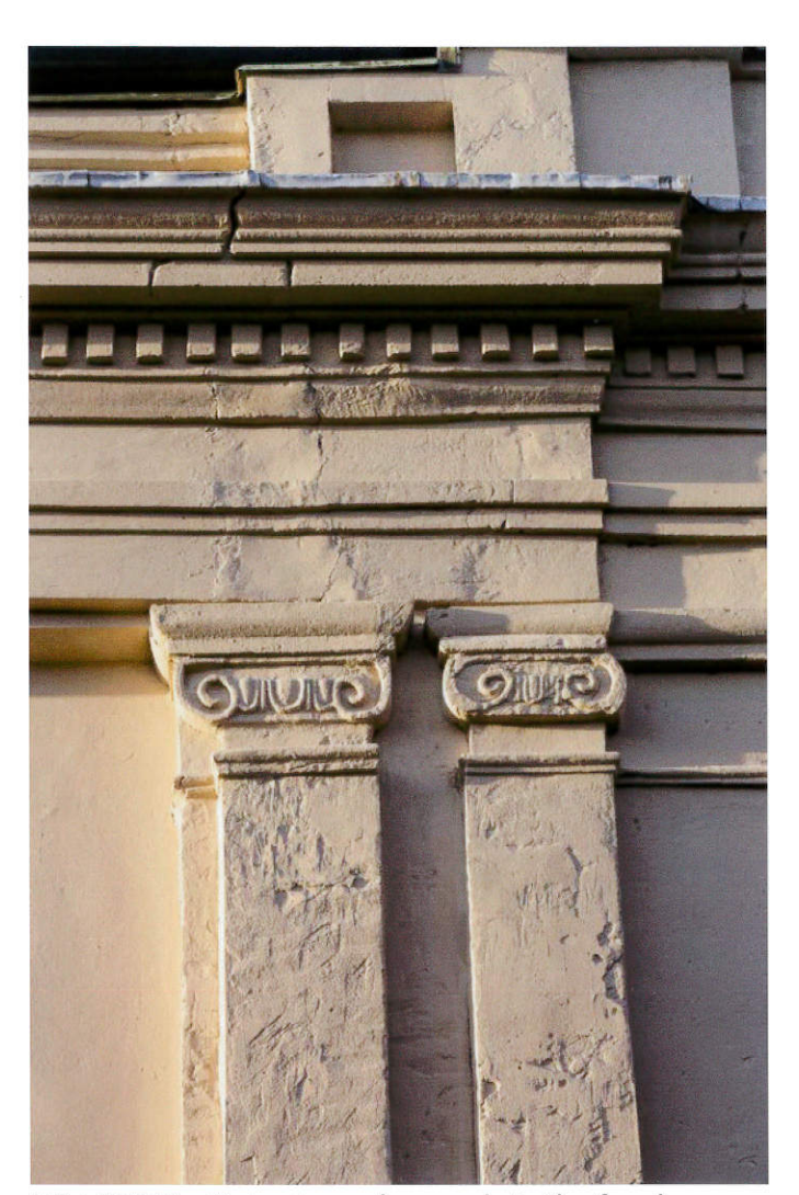
<u>E3A 1960 </u> - Exterior: closer detail of columns seen in photo E3A1963