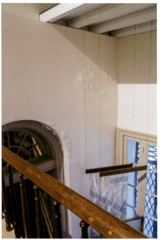
<u>E3A2048</u> - Interior: view of wall area from main staircase's second-floor landing