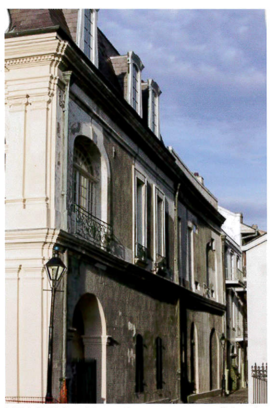
<u>E3A 1971 </u> - Exterior: corner of Jackson Square and Pirate's Alley