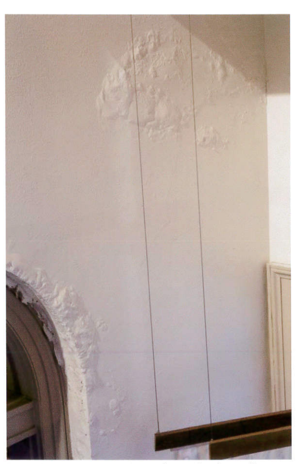
<u>E3A 2049 </u> - Interior: detail of wall area seen in photo E3A2048