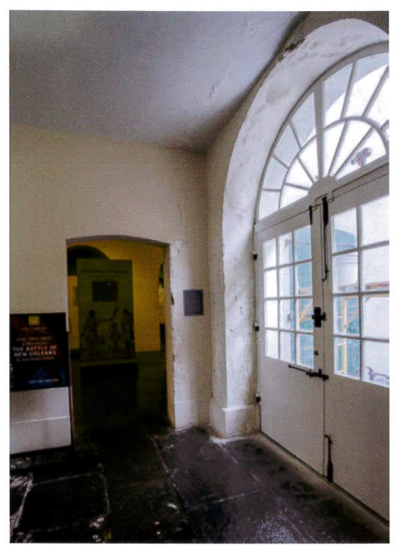
<u>E3A2027</u> - Interior: archway area surrounding door to exterior courtyard and adjacent to entrance for First Families of Louisiana exhibit