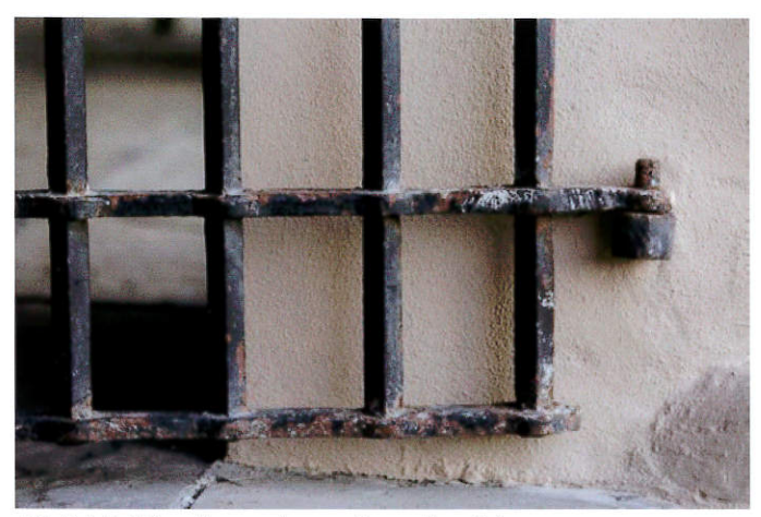
<u>E3A 1946 </u> - Exterior: detail of front entrance gate along Jackson Square