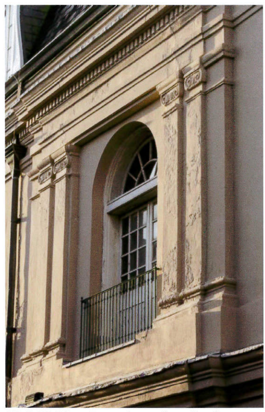
<u>E3A 1963 </u> – Exterior: detail of second-floor wall section along St. Ann Street