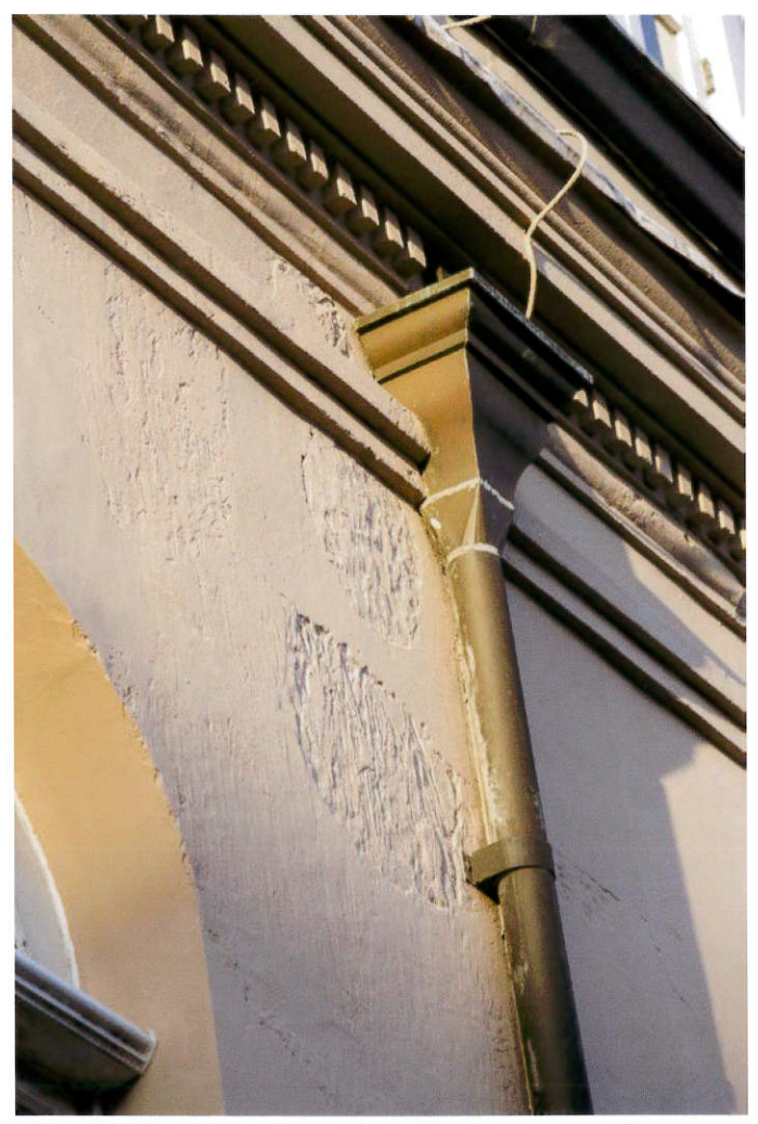
<u>E3A1950</u> - Exterior: detail of second-floor wall section seen in photo E3A1967