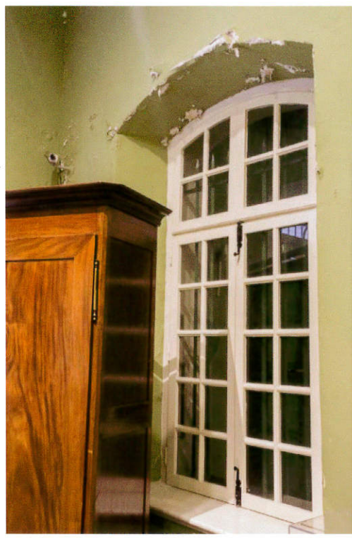
<u>E3A 2022 </u> - Interior: detail of window alcove in Colonial Louisiana exhibit (first floor)