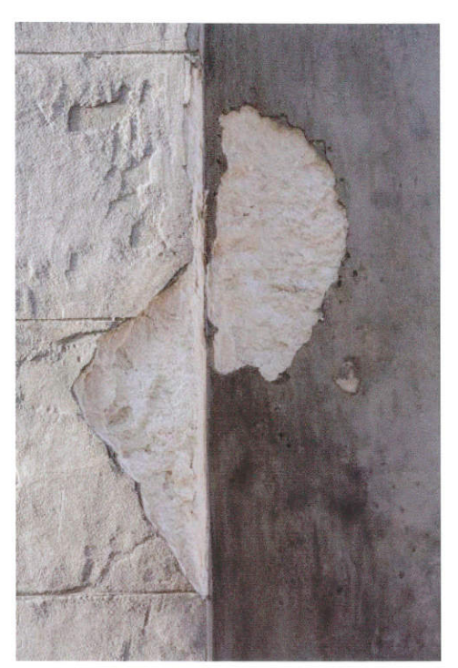
<u>E3A1973</u> - Exterior: detail of first-floor wall section along Pirate's Alley