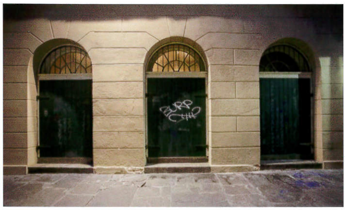
<u>E3A 1933 </u> - Exterior: first-floor wall section along Pere Antoine Alley