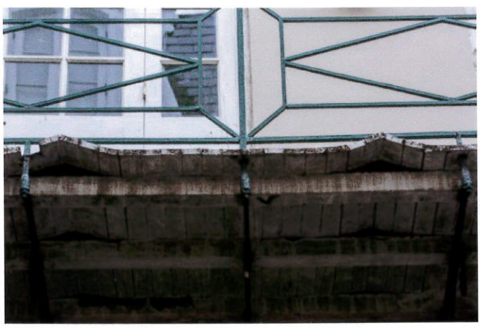
<u>E3A 1979 </u> - Inner courtyard: detail of underside of balcony