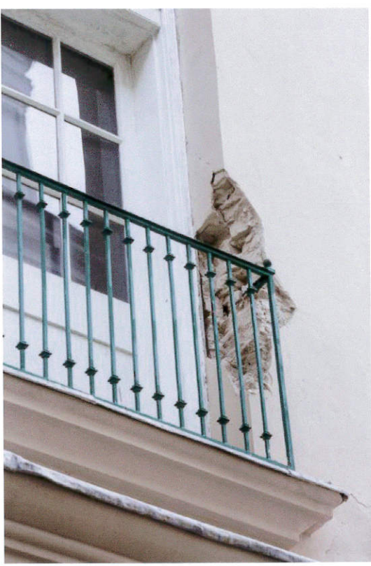
<u>E3A 1999 </u> - Exterior: detail of second-floor balcony along Pere Antoine Alley