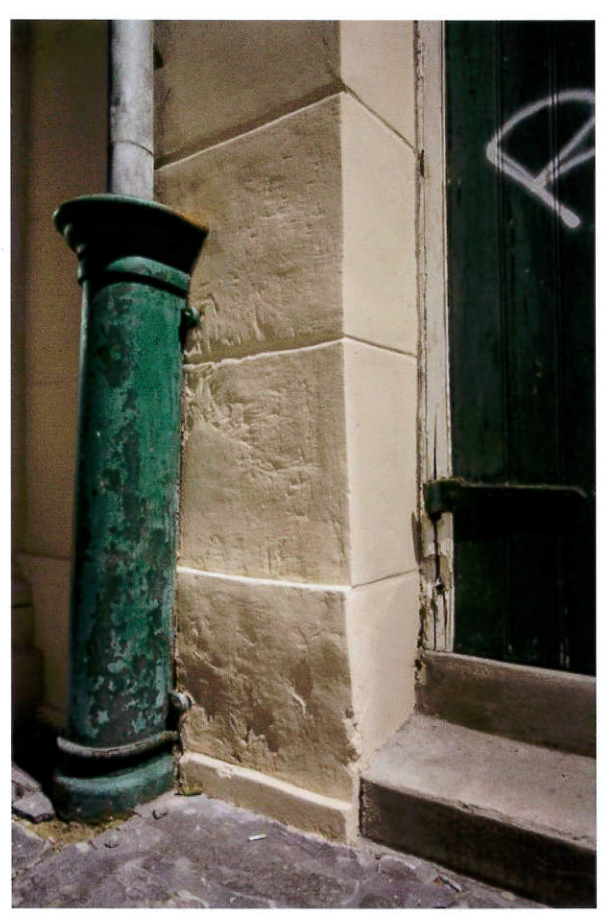
<u>E3A1938</u> - Exterior: detail of first-floor wall section along Pere Antoine Alley