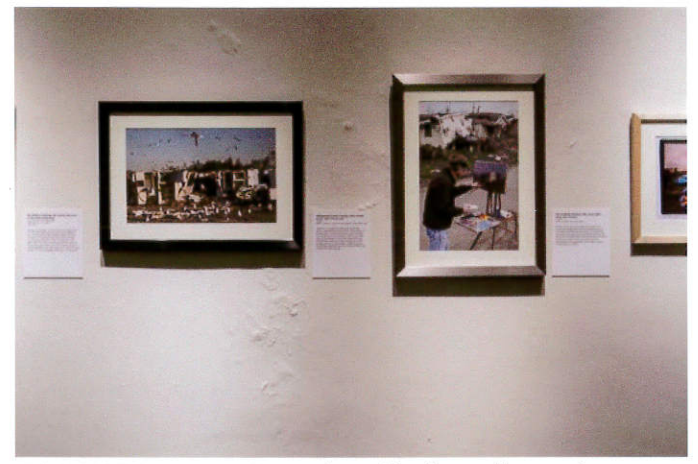
<u>E3A 2052 </u> - Interior: detail of wall section, hurricane photo exhibit (first floor)