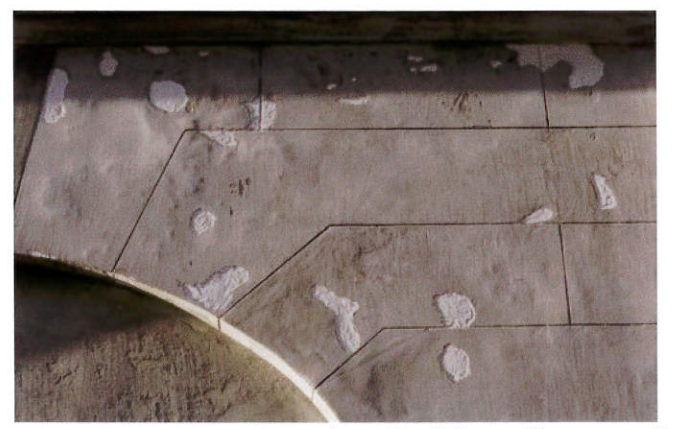
<u>E3A1975</u> - Exterior: detail of first-floor wall section along Pirates Alley