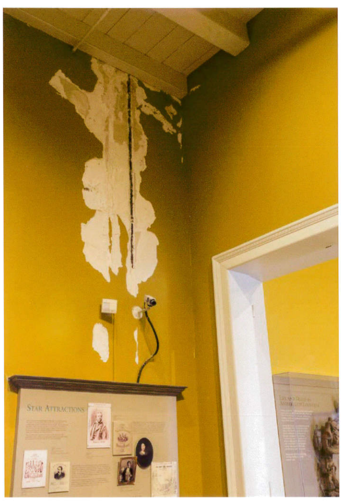
E3A2008 - Interior: detail of wall in Antebellum Louisiana exhibit (second floor)