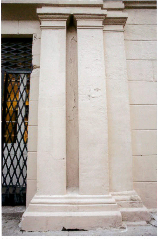
<u>E3A1928</u> - Exterior: columns adjacent to entrance gate area along St. Ann Street