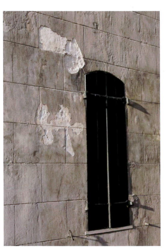
<u>E3A1972</u> - Exterior: detail of first-floor wall section along Pirate's Alley