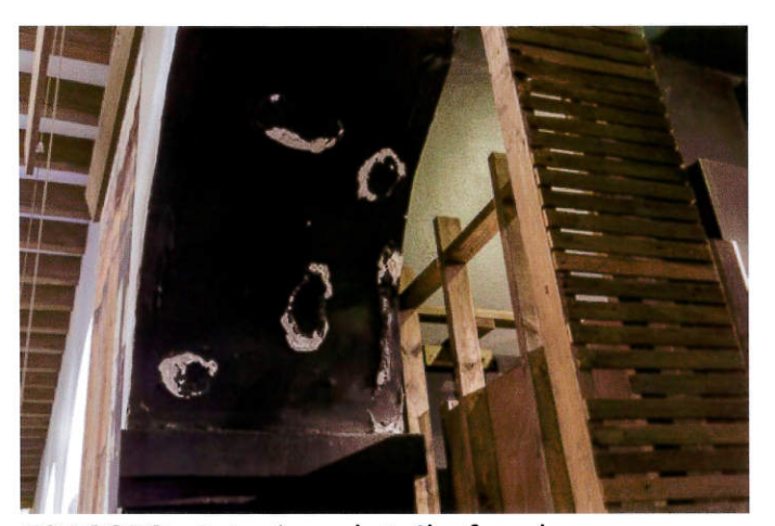
<u>E3A 2053 </u> - Interior: detail of archway adjacent to Living with Hurricanes exhibit