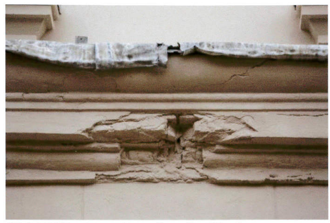
<u>E3A1920</u> - Exterior: detail of balcony area seen in photo E3A1964