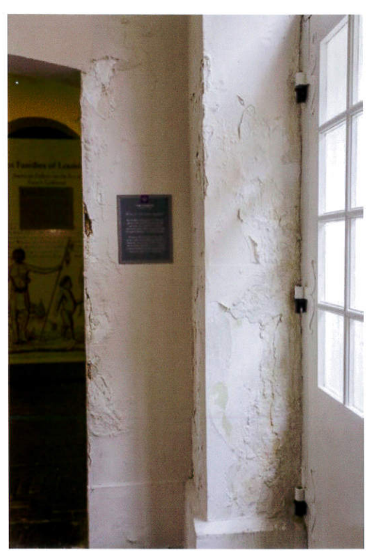
<u>E3A2028</u> - Interior: detail of lower wall section seen in photograph E3A2027