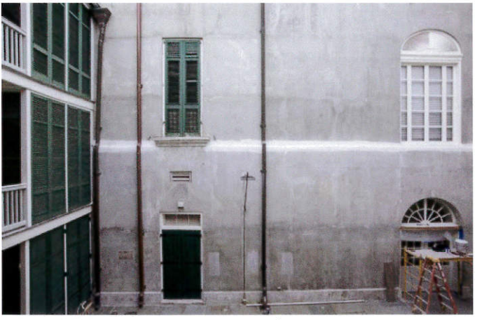
E3A1990 - Inner courtyard