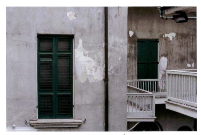
E3A1985 - Inner courtyard