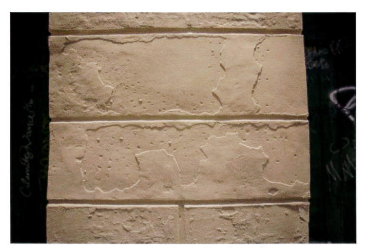
<u>E3A 1934 </u> - Exterior: detail of wall section seen in photo E3A1933