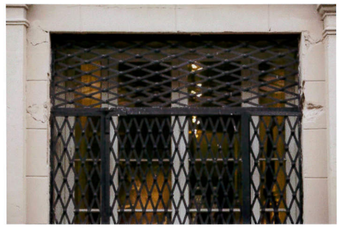
<u>E3A 1924 </u> - Exterior: side entrance gate area along St. Ann Street