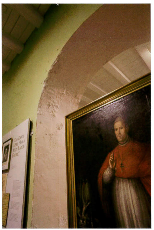
<u>E3A2025</u> - Interior: detail of arch in Colonial Louisiana exhibit (first floor)