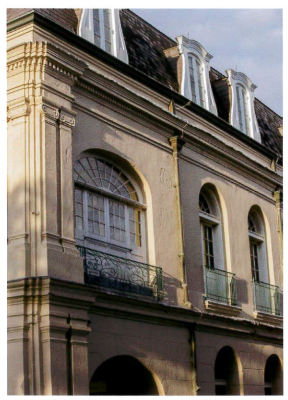
<u>E3A1967</u> - Exterior: second-floor wall section at Jackson Square and St. Ann Street