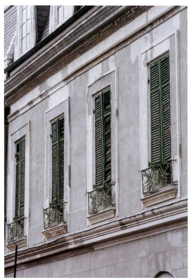
<u>E3A2032</u> - Exterior: second floor shutters along St. Peter Street