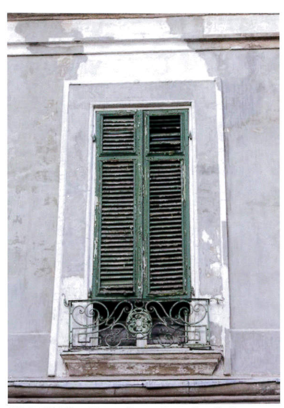
\underline{\mathsf{E3A1919}} - Exterior: detail of shutter along St. Peter Street