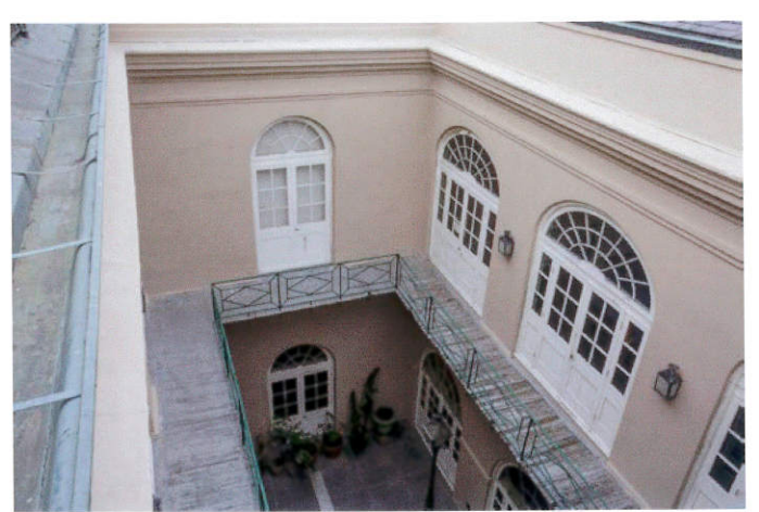
<u>E3A1984</u> - Inner courtyard: view from roof of Presbytère