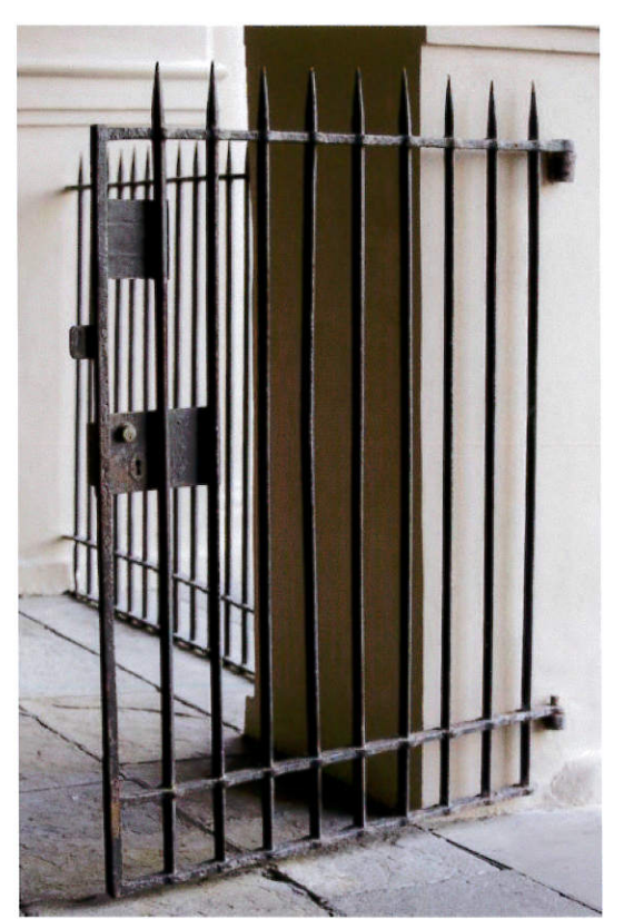
<u>E3A 1943 </u> - Exterior: front entrance gate along Jackson Square