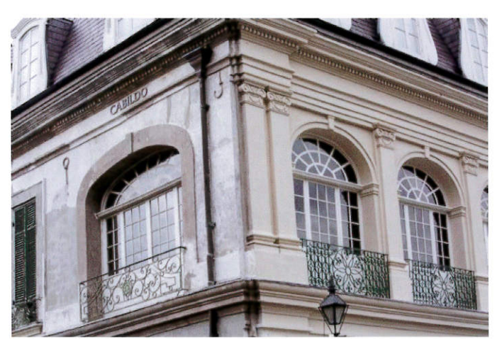
<u>E3A 2033 </u> - Exterior: second floor, corner of Jackson Square and St. Peter Street