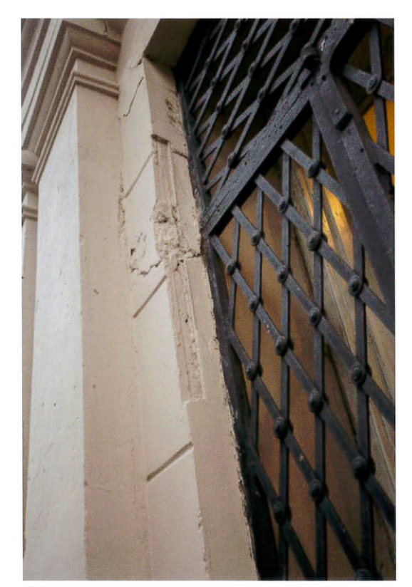
<u>E3A1932</u> - Exterior: detail of entrance gate area along St. Ann Street