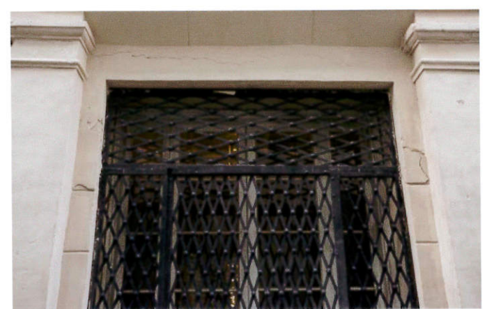
<u>E3A 2041 </u> - Exterior: side entrance gate area along Pere Antoine Alley