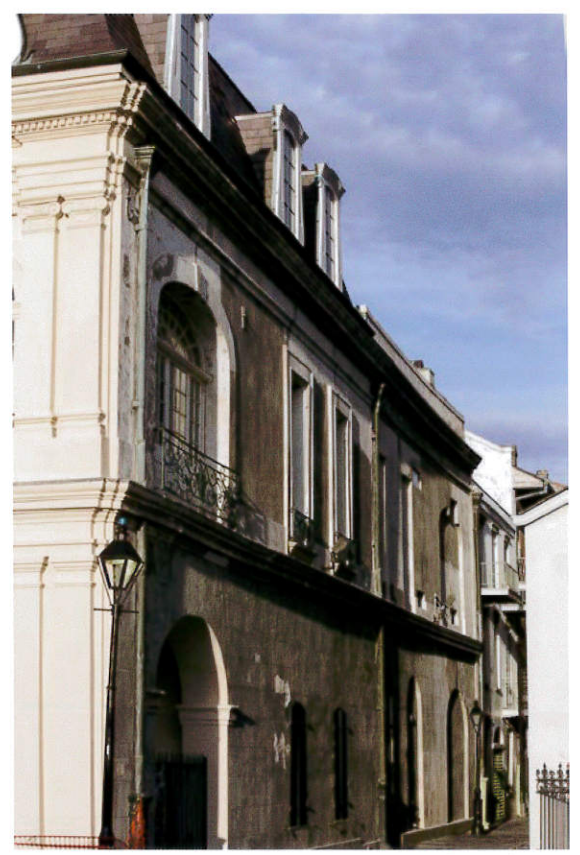
<u>E3A 1971 </u> - Exterior: corner of Jackson Square and St. Ann Street