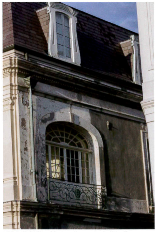
<u>E3A 1969 </u> - Exterior: detail of second floor along Pirate's Alley