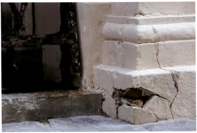
<u>E3A 1998 </u> - Exterior: detail of side entrance gate area along Pere Antoine Alley